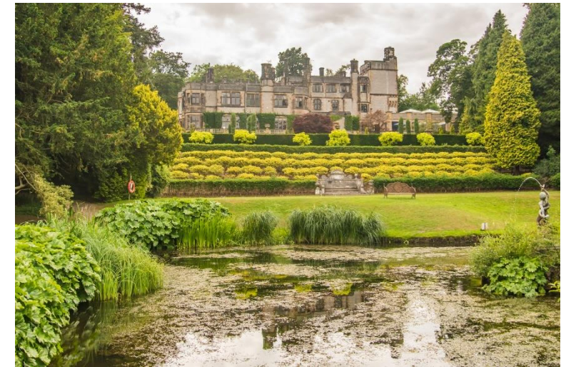
This is the house and garden.