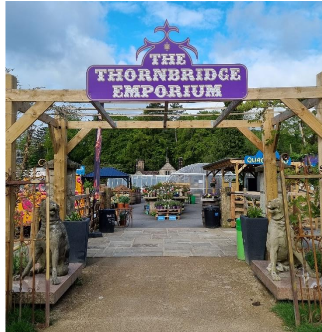
This is the shop.