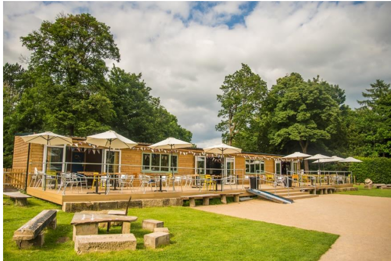
This is the café.

This means it is a place where I can have a lovely day out with my family and friends.